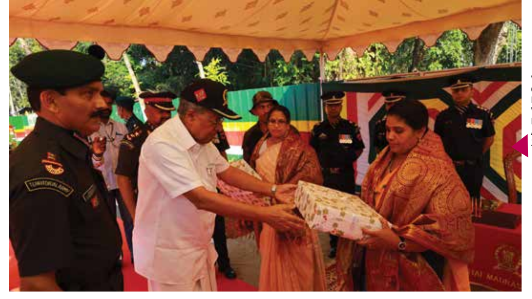
VEER NARI'S FELICITATION BY CHIEF MINISTER OF KERALA PINARAYI VIJAYAN DURING VISIT AT 122 INFANTRY BATTALION (TERRITORIAL ARMY) MADRAS ON 02 JAN 2023