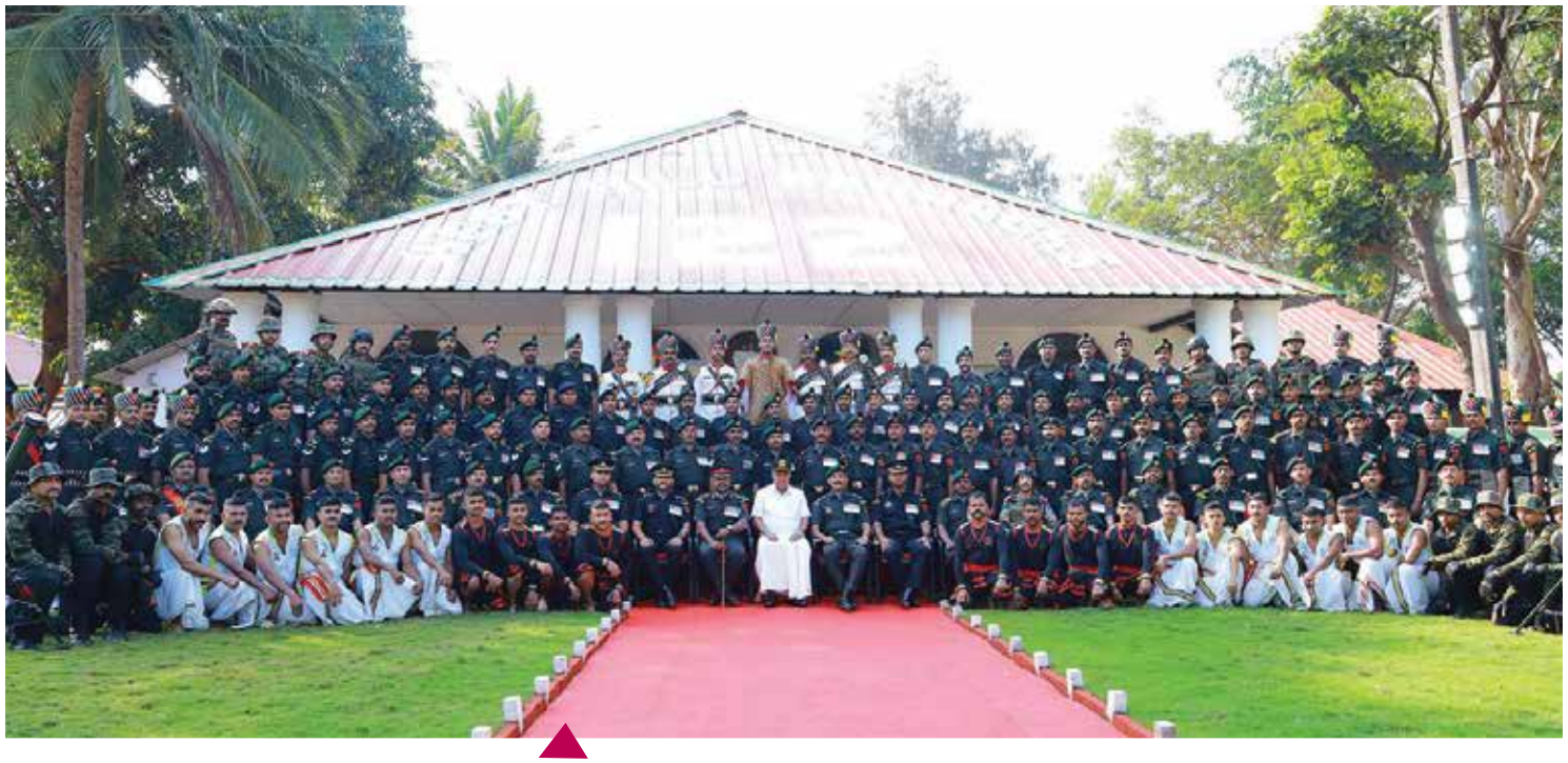
PINARAYI VIJAYAN, CHIEF MINISTER WITH TROOPS OF 122 INFANTRY BATTALION (TERRITORIAL ARMY) OF THE MADRAS REGIMENT AT WEST HILL BARRACKS, KOZHIKODE